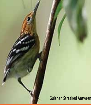
Guianan Streaked Antwren