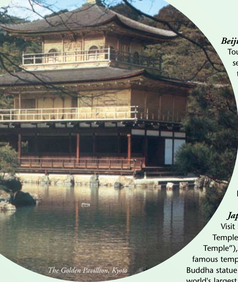
The Golden Pavillion, Kyoto