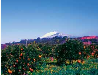
Mount Etna, Sicily