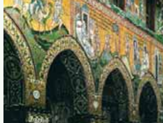
Monreale Cathedral, Sicily