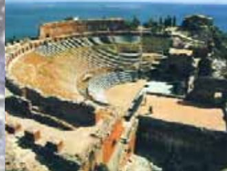
Greco-Roman temple, Sicily