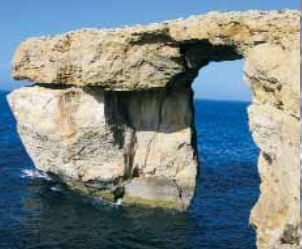
Azure Window, Gozo