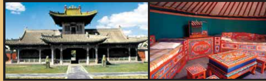
Bogdo Khaan Winter Palace Museum in Ulaanbaatar