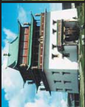
Jamraisig Temple in Ulaanbaatar