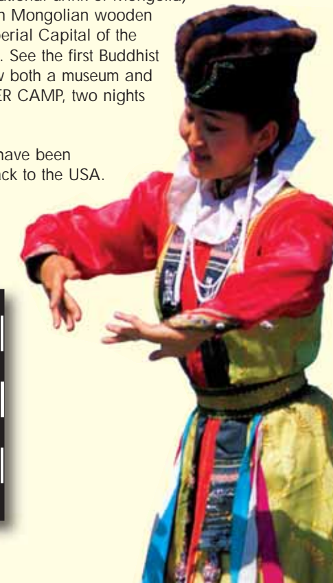
Mongolian folk dance