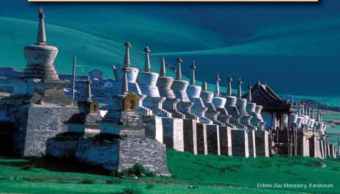
Erdene Zuu Monastery, Karakorum

This is a unique program for those who have a strong desire to explore spectacular natural areas, learn about the history and culture of Mongolia, and witness the total solar eclipse. Since we will be traveling to remote areas, travelers should possess a spirit of adventure and a willingness to be patient and flexible. This program is active and involves walking on uneven terrain. Although we cover the longest distances comfortably by air, some travel will be over bumpy roads. Not all coaches and accommodations are air-conditioned. Accommodations in Ulaanbaatar are in a comfortable, modern hotel. Elsewhere, we stay in gers, traditional nomadic dwellings that many Mongolians still live in today. They are large, dome-shaped tents with a wood frame covered by felt and canvas. Furnishings include regular western-style beds, a small table with chairs, and carpeted floors. The accommodations can be single, double or triple at your request. Western-style toilets and hot shower facilities are separate from the gers and shared, but well-maintained. The restaurant ger serves a combination of western and typical Mongolian dishes providing the opportunity to try new things while always seeing something familiar. Portable generators and solar power provide electric lighting in each ger, and there are outlets available at both camps for charging batteries, etc. The weather should be warm at this time of year, but the gers tend to remain comfortably cool.