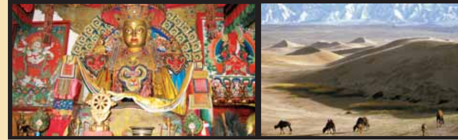
Buddha at Erdene Zuu Monastery